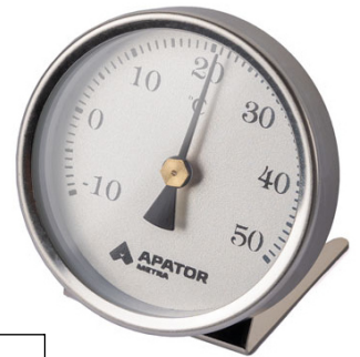
TABLE THERMOMETER DTST