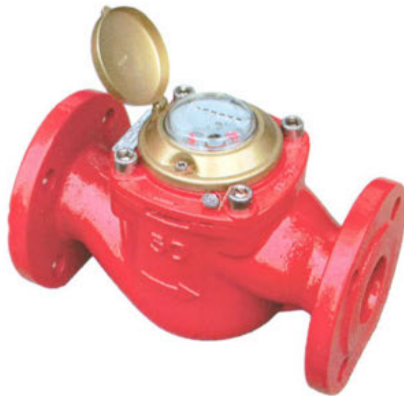
Picture No.1 Woltman water meter MP130