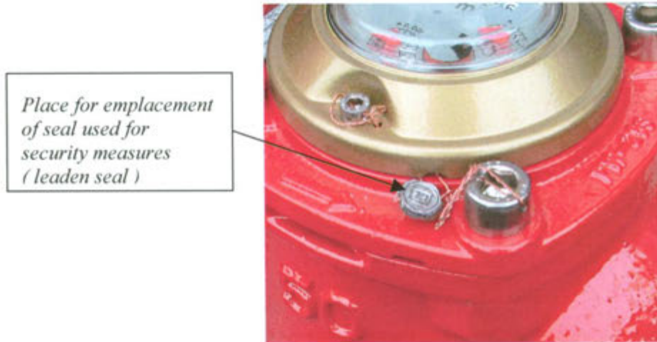
Picture No.2 Emplacement of the seal for security measures

Connection of counter shroud and water meter body shall be sealed by conformity mark (lead seal) (Picture No. 2)